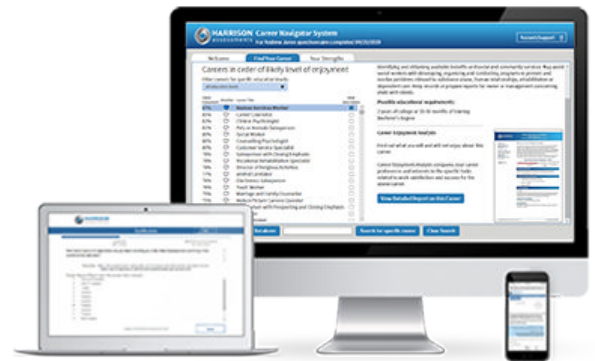
Online Interactive Career Portal